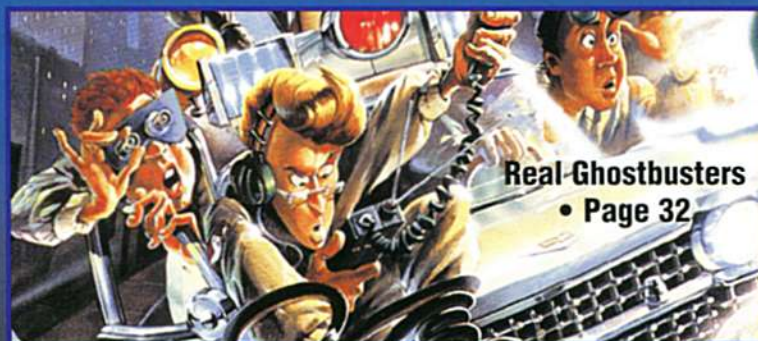
Real-Ghostbusters • Page 32