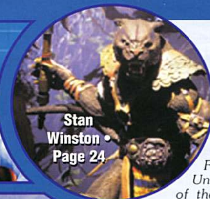
Stan Winston • Page 24