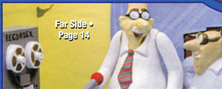
Far Side • Page 14