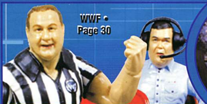
WWF • Page 30